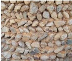
Stone with mud